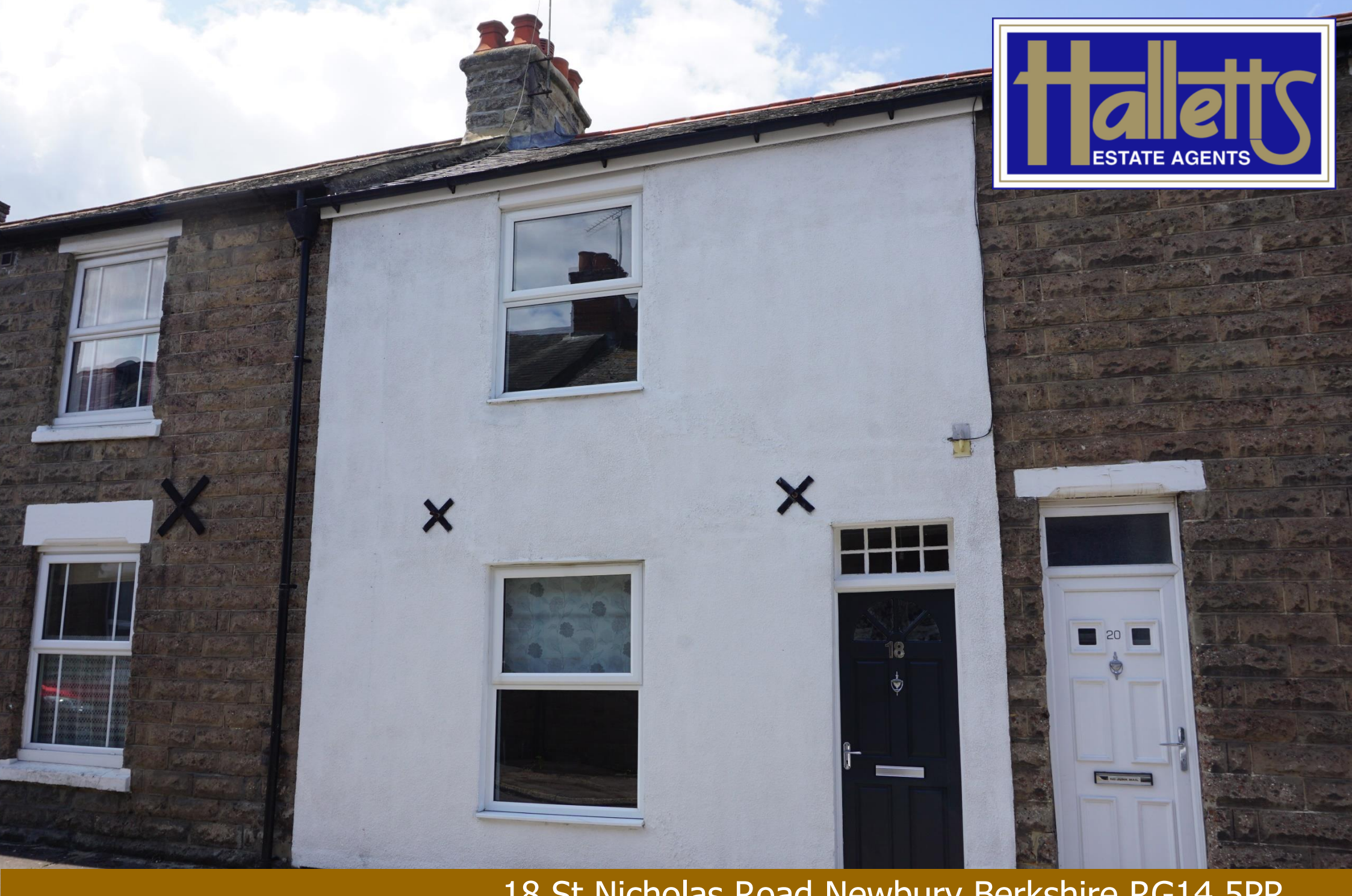
18 St Nicholas Road Newbury Berkshire RG14 5PR